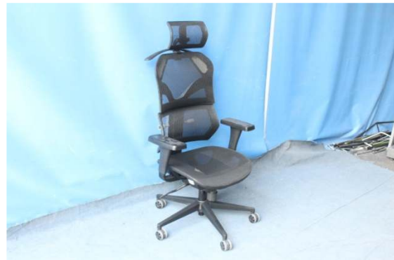
Sample SL-T76 - View 6