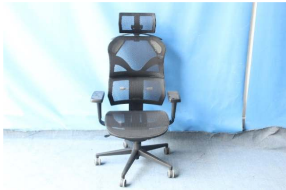
Sample SL-T76 - View 5