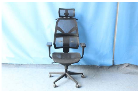
Sample SL-T77 - View 9