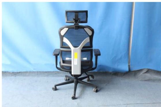
Sample SL-T76 - View 7