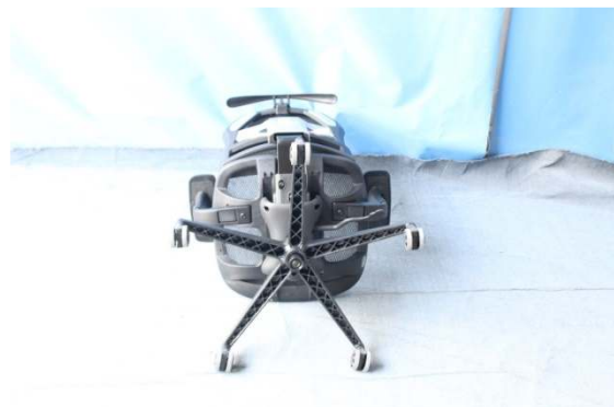
Sample SL-T76 - View 8