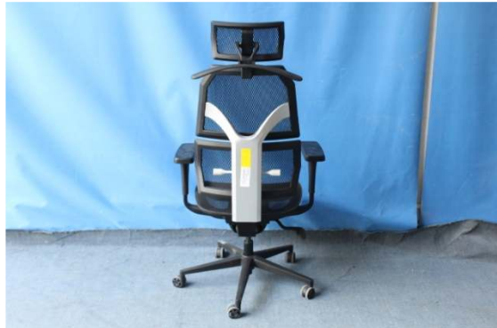
Sample SL-T77 - View 11