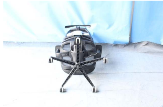
Sample SL-T77 - View 12