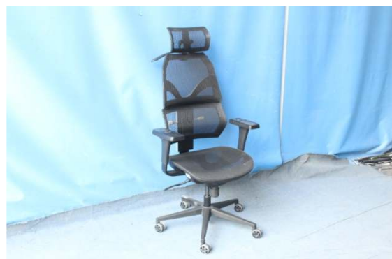
Sample SL-T77 - View 10