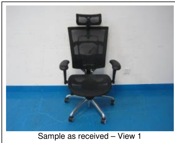
Sample as received – View 1