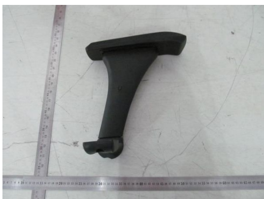
Material No. 4