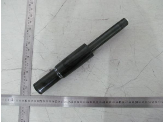
Material No. 13 & 13a