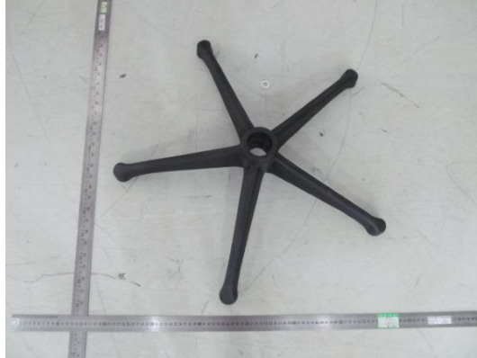
Material No. 15