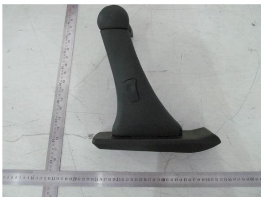
Material No. 8