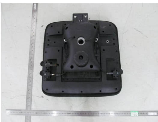
Material No. 10 & 11 & 12