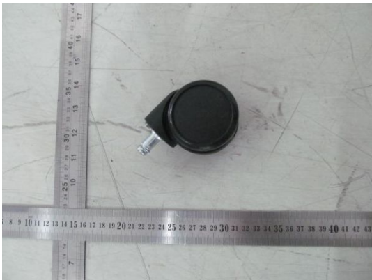
Material No. 16