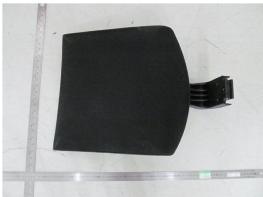
Material No. 1